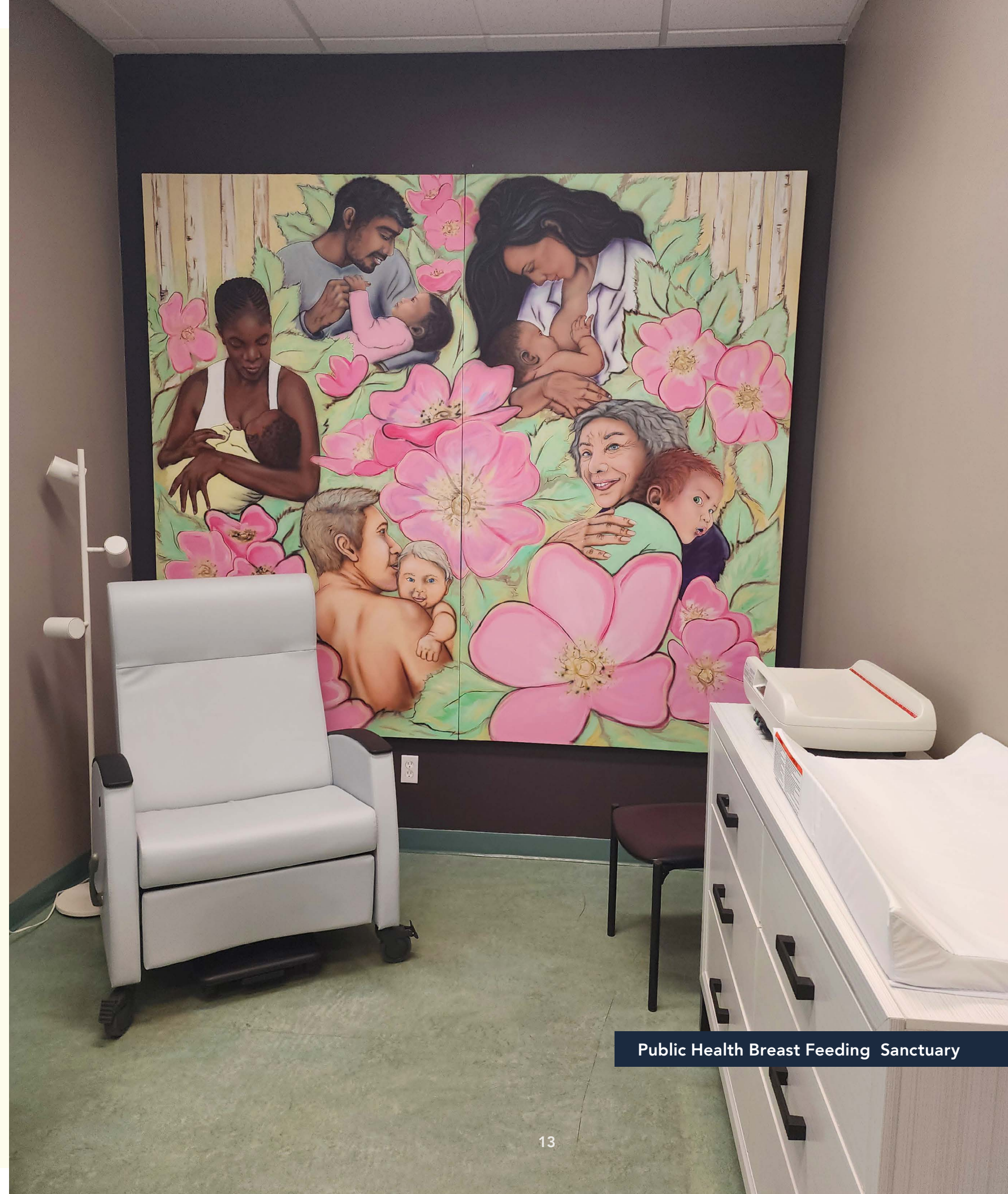
Public Health Breast Feeding Sanctuary