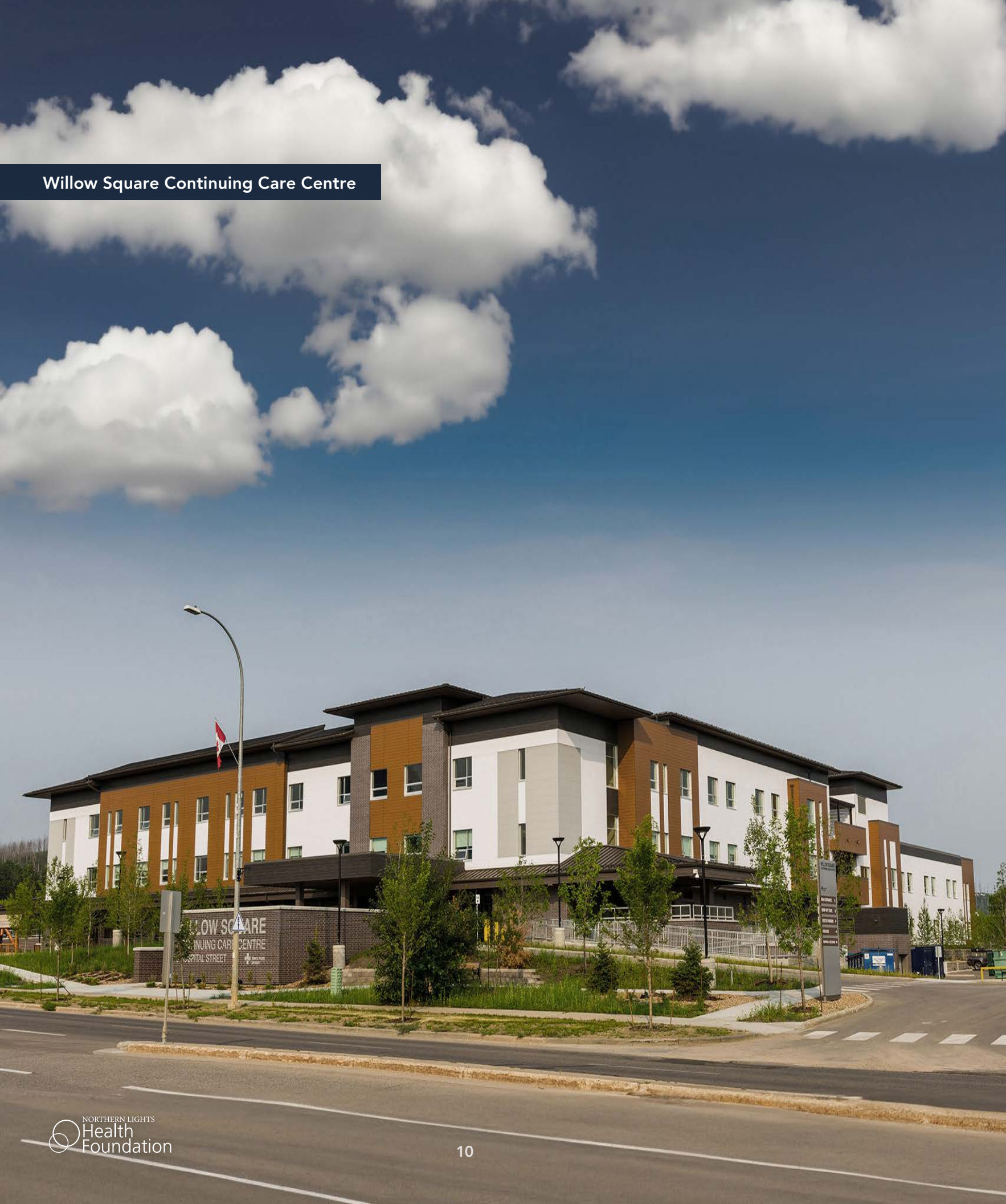
Willow Square Continuing Care Centre