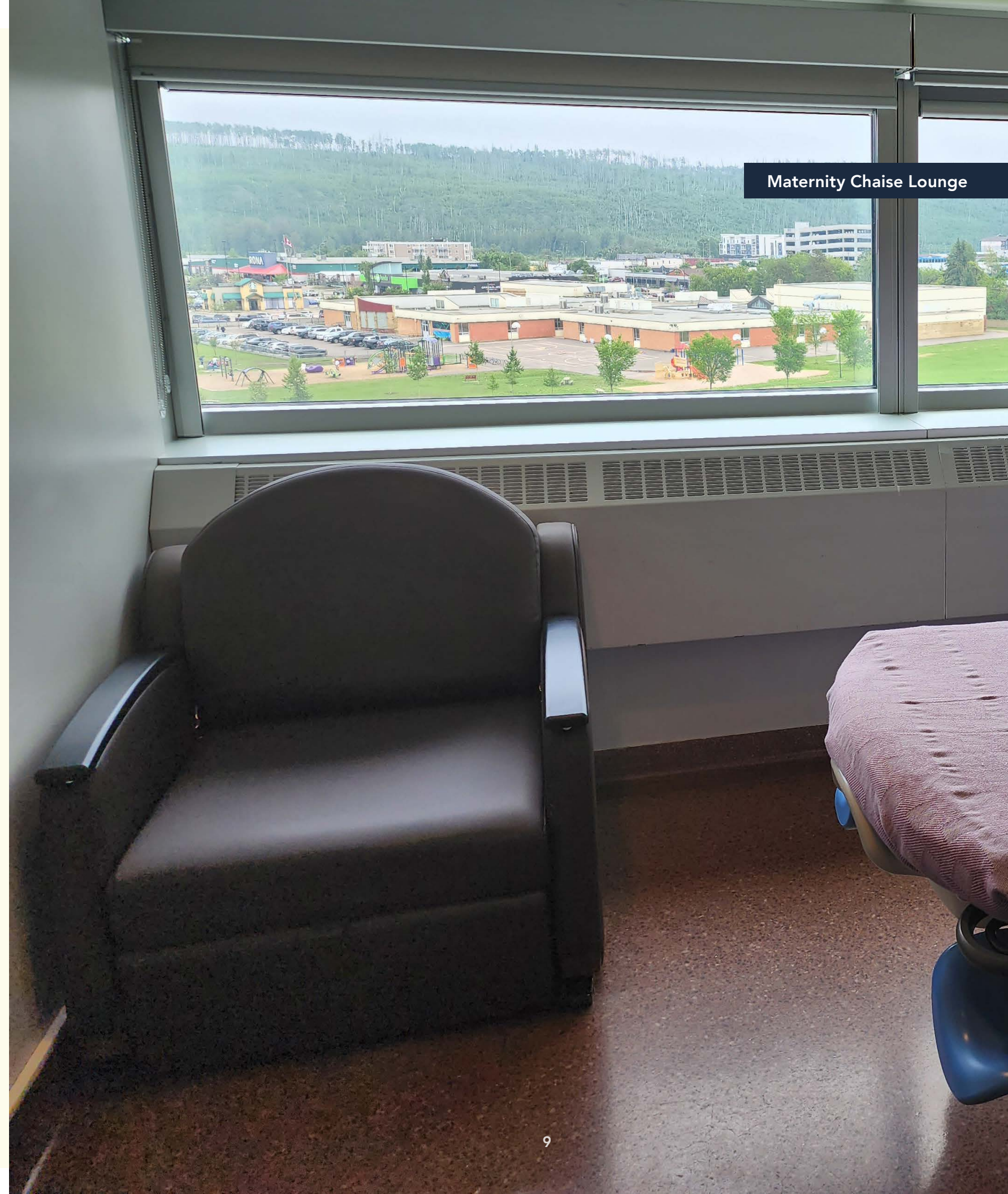
Maternity Chaise Lounge

The Ambulatory Care unit at the hospital received a new holter monitor system and four device recorders. A holter monitor is a small wearable device that records the heart rhythm and is used to detect or determine the risk of irregular heartbeats in patients. Currently, pediatric holter data is sent to Edmonton for a specialist to interpret, but the upgraded system will support physicians to access the system remotely, resulting in quicker data interpretation.