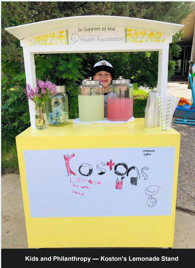
Kids and Philanthropy — Koston's Lemonade Stand