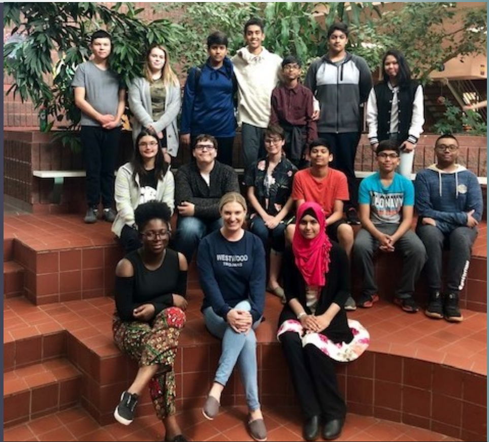
Westwood High School Grade 9 Students Hosted a Fun Fair and Donated the Proceeds