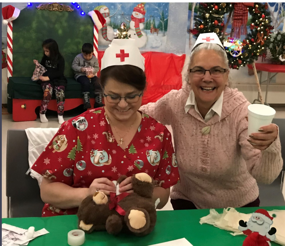
2019 Fort Chipewyan Festival of Trees A Huge Success

The event was entirely family-friendly and low-cost to community members. Featuring a tree auction Gingerbread House Contest, photos with Santa and Mrs. Claus, Decorate-a-Cookie, and Candy Cane Canteen. There was also a Wreath Decorating Contest, a huge Toy Raffle, a Gift Shop Corner, and a Teddy Bear Hospital. Great fun for everyone!