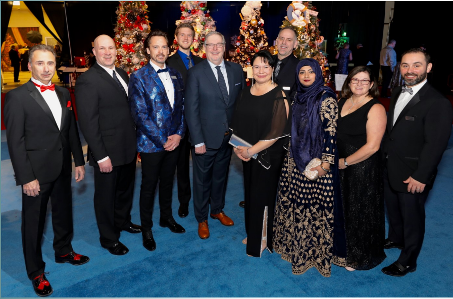
Board Members Ready to Greet 30th Anniversary Festival of Trees Guests