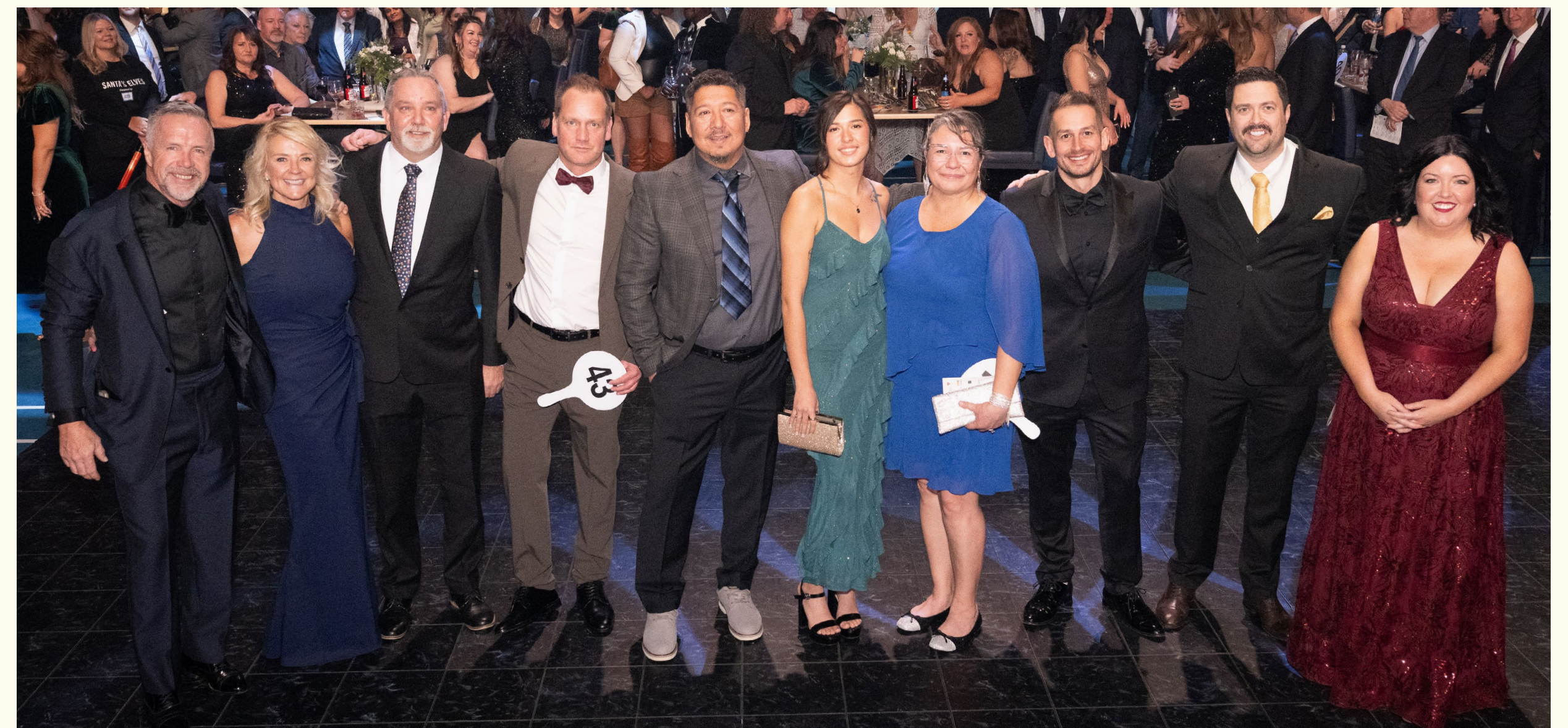
Partners from APE Maintenance, the Giles Family Foundation, and AlumaSafway with SMS Equipment and the NLHF team, commemorating the $180,000 purchase of the "Comfort and Care Tree" to provide comfort and support to cancer patients across Wood Buffalo.