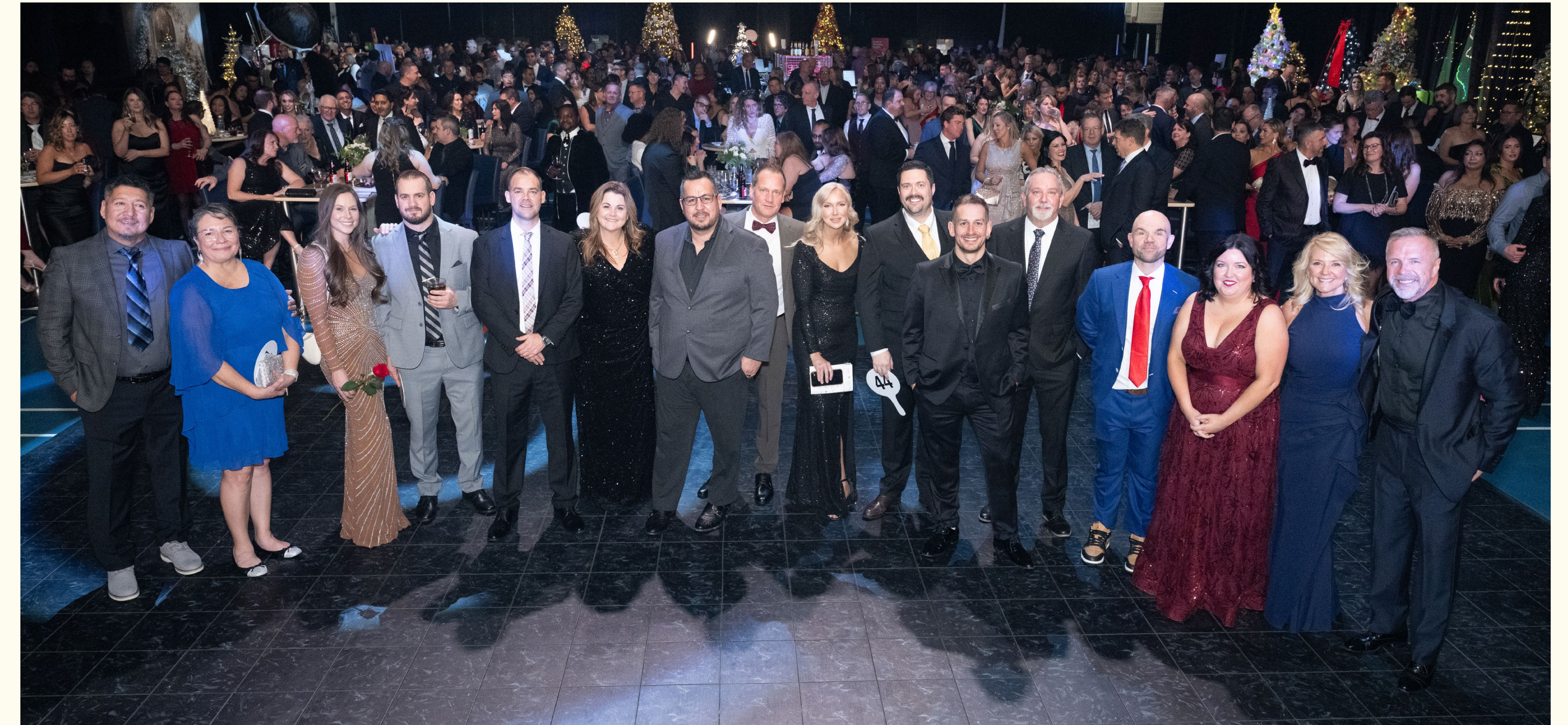
A Legendary gathering. This photo captures a portion of the distinguished donors who joined us at the Something Legendary Tree table – an unforgettable evening defined by generosity, celebration, and shared purpose.